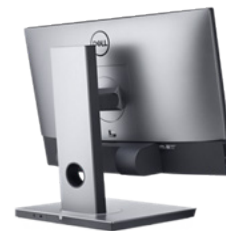
OPTIPLEX ALL-IN-ONE PORT COVER

In this custom Height Adjustable Stand, a DVD+/-RW is integrated into the base of the stand for optimal convenience.