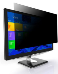
TARGUS 24" 4VU PRIVACY SCREEN

Boost This 23.8" FHD screen with 3-sided ultrathin bezels is designed for seamless multi-display productivity with your 24" All-in-One. Its small base frees valuable workspace.