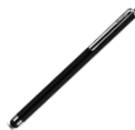
TARGUS STYLUS FOR CAPACITIVE TOUCH DEVICES

Compact design and chiclet keys, this essential desktop solution offers the convenience of wireless and clutter-free performance.