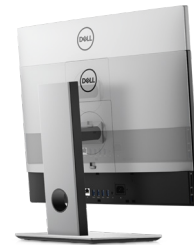
OPTIPLEX 7470 ALL-IN-ONE HEIGHT ADJUSTABLE STAND

Tilt your display forward, backward, or recline to a 60 degree angle. This stand makes touchscreen interaction comfortable.