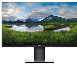
DELL 24 MONITOR - P2419H

Boost This 23.8" FHD screen with 3-sided ultrathin bezels is designed for seamless multi-display productivity with your 24" All-in-One. Its small base frees valuable workspace.