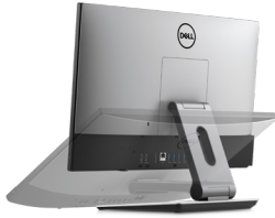
OPTIPLEX 7470 ALL-IN-ONE ARTICULATING STAND

Tilt your display forward, backward, or recline to a 60 degree angle. This stand makes touchscreen interaction comfortable.