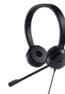
DELL PRO STEREO HEADSET - UC350

Ensure your valuable information is kept private, without compromising screen clarity. Meet new standards in protection with this anti-glare privacy screen that also filters blue light.